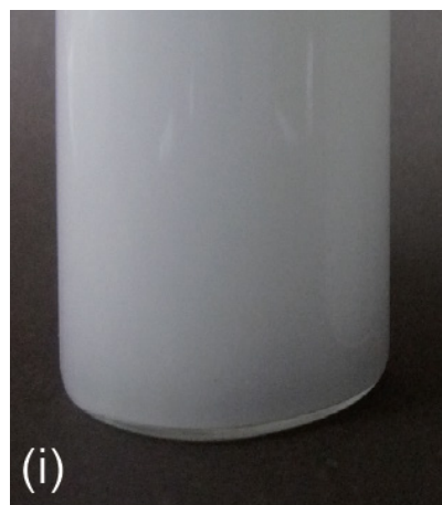
(i) GT 930, 0.8% active with 5% Titanium dioxide. Three month stability.