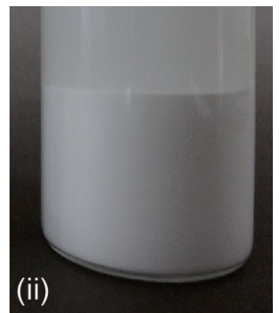
(ii) Standard thickener solution, 0.8% active with 5 % Titanium Dioxide.